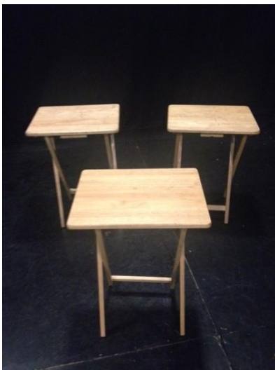
3 FOLDABLE WOODEN TABLES 0.48M by 0.37m Height: 0.66m