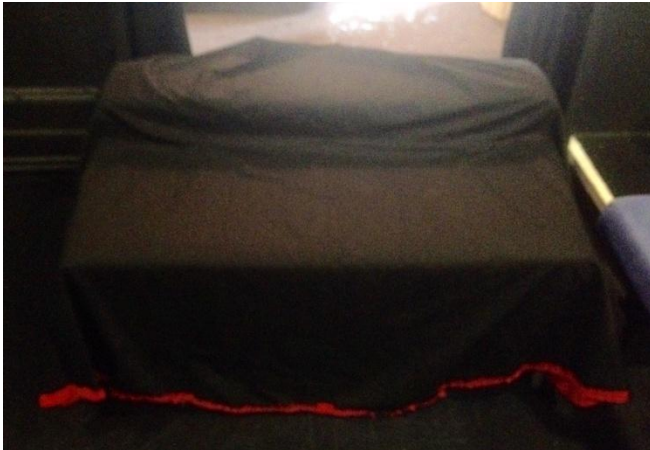
FOLDED BED + RISER = SOFA!