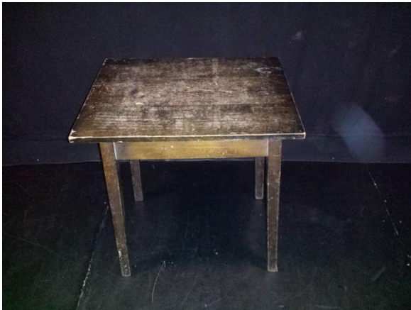
SMALL WOODEN TABLE 0.61m by 0.46m Height: 0.66m