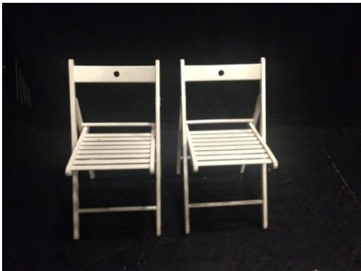
2 WOODEN FOLDABLE CHAIRS