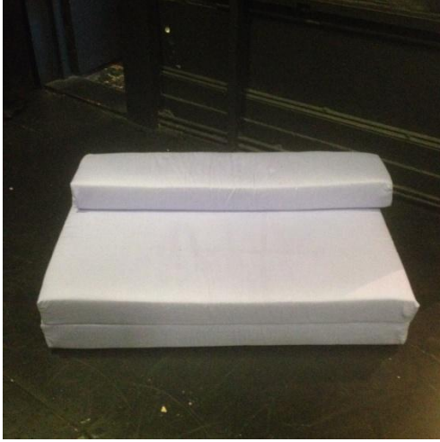
BED – FOLDED 84cm x 1m95