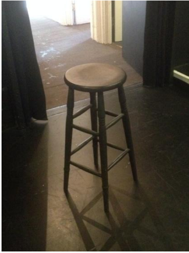
1 HIGH WOODEN STOOL