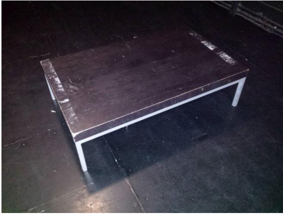
RISER 0.97m by 0.6m Height: 0.27m