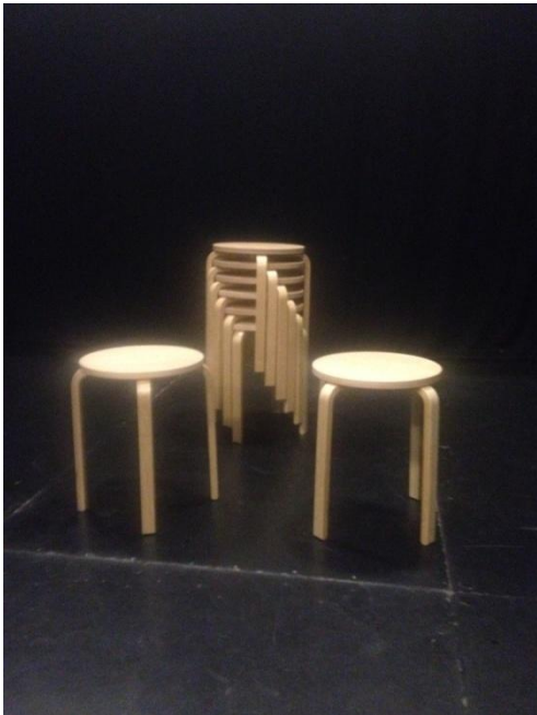
8 WOODEN STOOLS