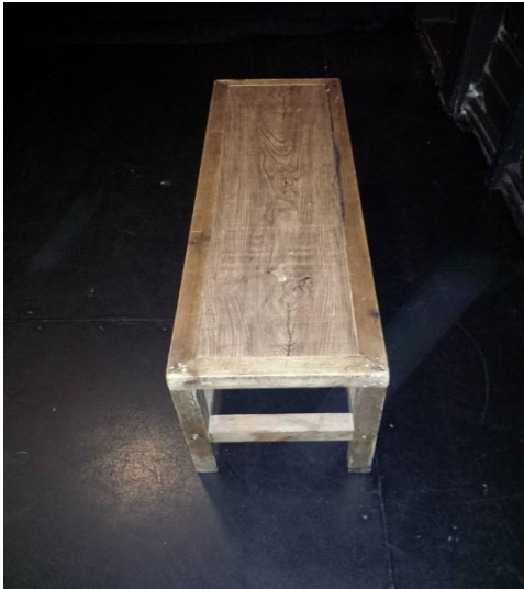
WOODEN BENCH 1.2m by 0.35m Height: 0.4m