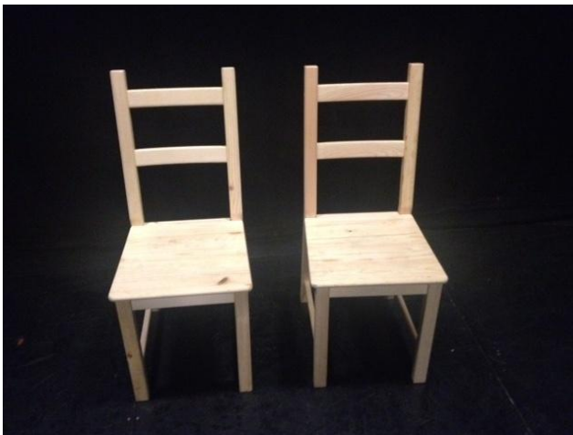
WOOD UPRIGHT CHAIRS Now painted black 2 available