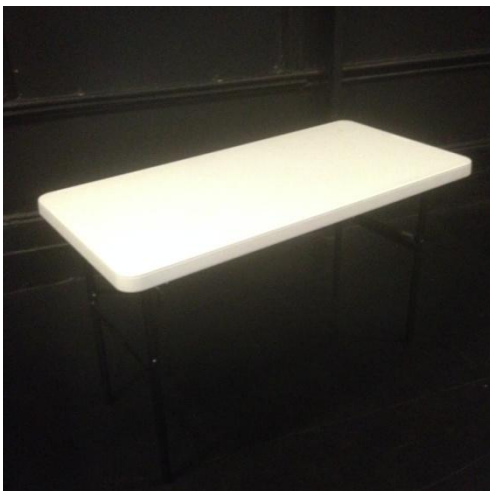
LARGE FOLDING TABLE 1m22 by 0.60m Height: 0.65m